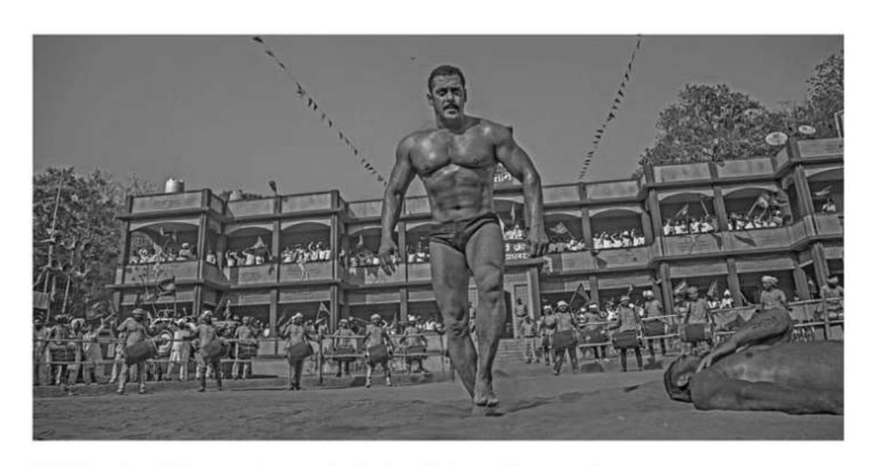
FIGURE 13.1: The ripped, muscular body of Salman Khan – Sultan . Courtesy : Ali Abbas Zafar.