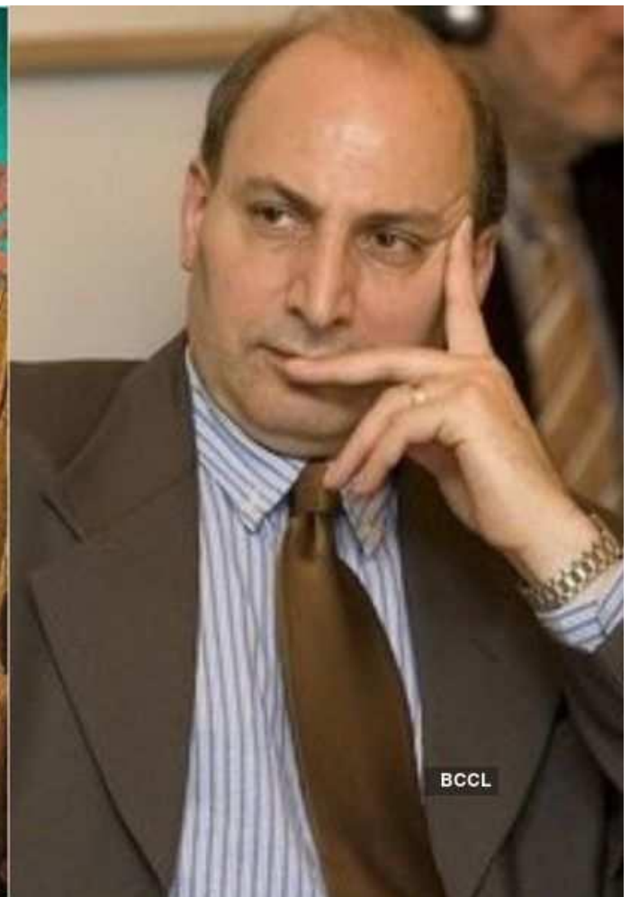
'The Courage to Exist' by Ramin Jahanbegloo