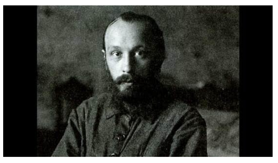
Mikhail Bakhtin, philosopher and literary theorist (Wikimedia Commons)

In a post-print and post-truth era, the ever-expanding world of fiction shapes the human longing for creative fulfilment and emotional connection. The popularity of fiction, especially novels, owes much to its subversion of cultural and social hierarchies and the depiction of the reversal of the political system. The novel, an exemplary act of communication, picks holes in all that we hold dear.