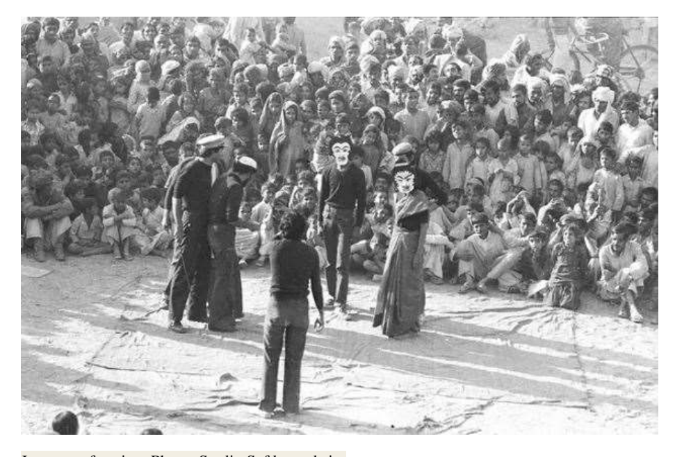
Janam performing.

Janam was active for two years before the Emergency was declared in 1975. These were fertile, dynamic years both for them as a theatre group and for other cultural activists around them – the times reverberated with a sense of common interest in societal and political issues such as economic uplift, human rights, worker's rights, women's empowerment.