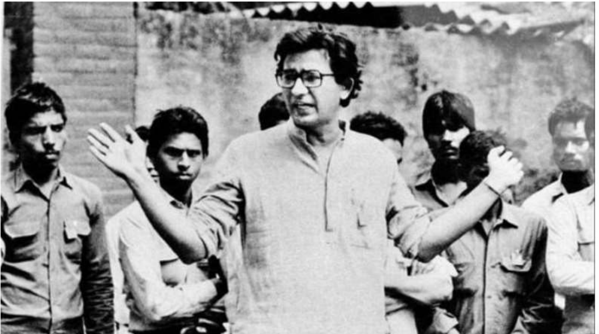
Since its inception in 1973, Safdar Hashmi's JANAM has staged over 8,500 performances in 140 cities, including Delhi, Mumbai, Kerala and West Bengal.